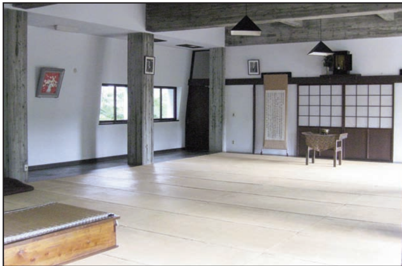
Ichikukai Dojo Zendo