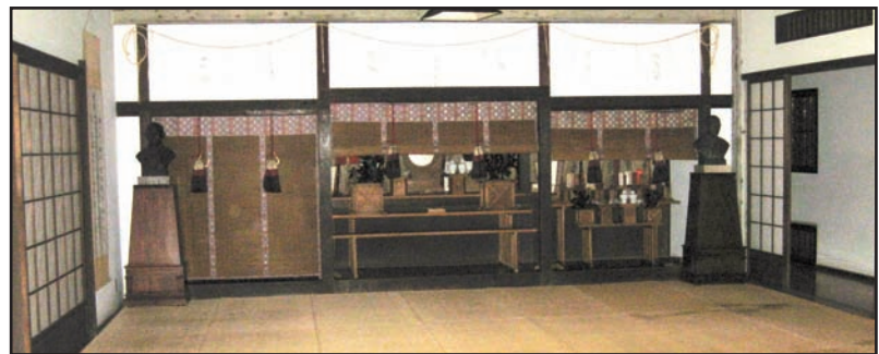
Ichikukai Dojo Kamidana (altar)

I really don't want to do it at one level, but at the same time this is exactly what I wish for. In January 1987 Terry Waite, a hostage negotia-